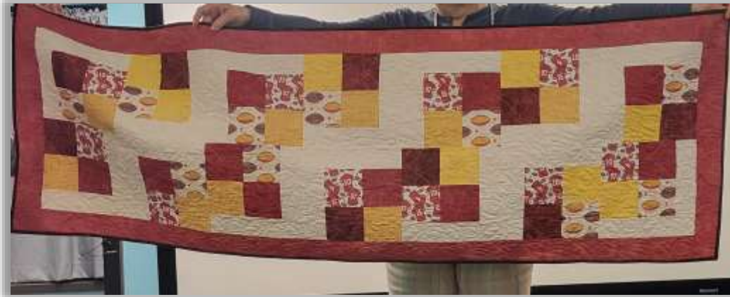
Dae Curtiss - Chiefs table runner