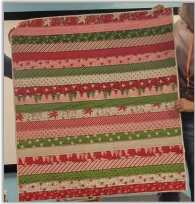
Lara Stevens 2 lap quilts and a small table runner