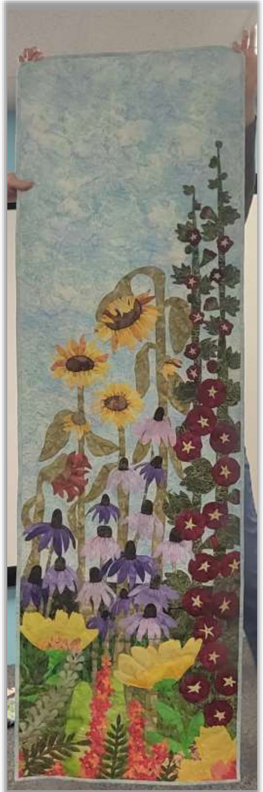
Cindy Cherry—Wall Hanging