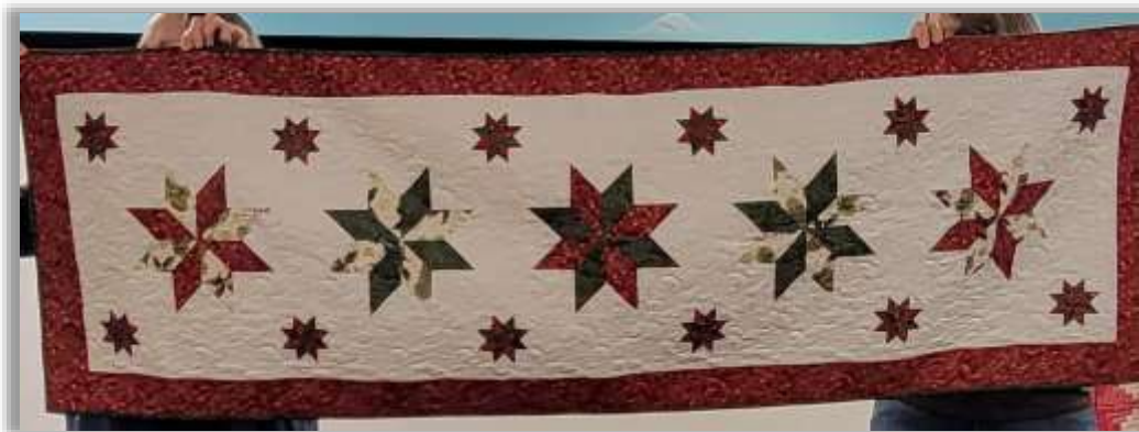
Pat Lawson—2 quilts and 2 table runners