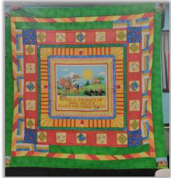
Liz Granberg –Jerome